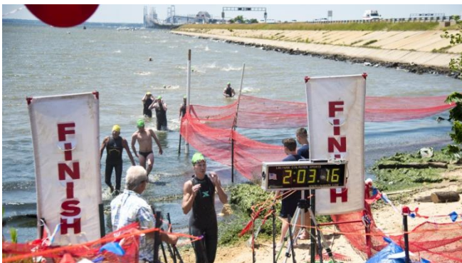
Swimmers in the Great Chesapeake Bay Swim cross the finish line.

Approximately 325 swimmers (as compared to 440 swimmers in 2014 and 353 in 2015) completed the 2015 One Mile Bay Challenge Swim. The 4.4 Mile Swim offered a consistently warm (74 to 78 degree) water temperatures throughout most of the course. Approximately 615 swimmers completed the 4.4 Great Chesapeake Bay Swim. Race results for the last five years indicate that between 79 and 97 percent of swimmers finished the Great Chesapeake Bay Swim. The lowest completion rate of the race occurred in 1991 and 1992, when a strong ebb current in the main channel beneath the Bay Bridge led to fewer than 20 percent of swimmers finishing the event. Results can be found at www.linmark.com