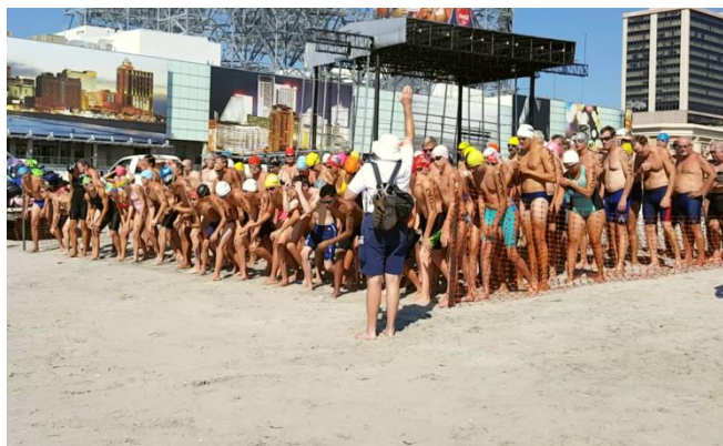
Start of the 2016 Pageant Swim