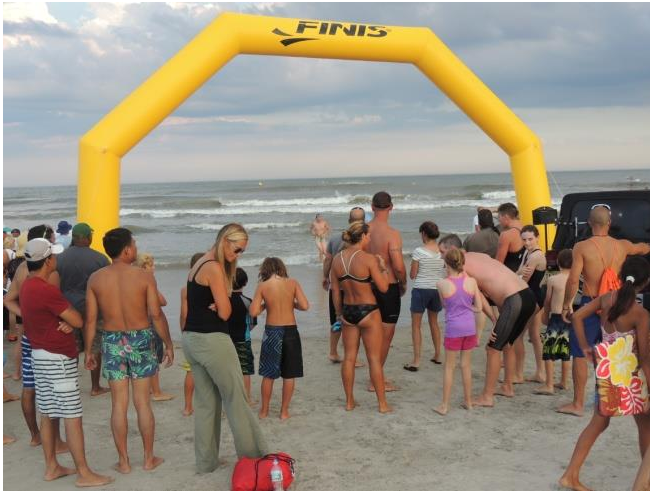
2016 Pier-to-Pier Challenge "Golden Arch" Finish Line