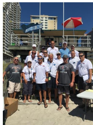
Officials at the 87 th Pageant

August 27 th 2016 – and the recently reconstituted 87 th Annual Pageant Swim was held in Atlantic City. After the Atlantic City Beach Patrol cancelled the swim indefinitely this season due to the lack of resources to manage the swim, the East Coast C-Cerpants along with other volunteers plus sanctioning from USA Swimming saved this historic swim. Concessions were made to the Atlantic City local government including moving the date of the swim to the Saturday morning before Labor Day weekend, changing the location of the swim further south, modifying the direction of the swim course based on the prevailing current, and shortening the distance from 1½ Miles to just a 1 Mile Ocean Swim for 103 swimmers.